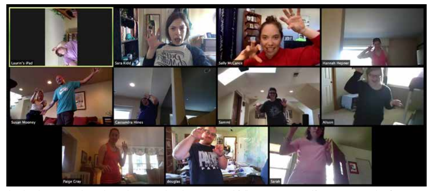
The ambassador community embraces online virtual programming during the COVID-19 crisis, a shift allowing participants near and far to participate in yoga, dance fitness, games and critical social connection during a time of isolation.

A community event barn will offer space for programmatic activities such as yoga, dance fitness, social connection, life skills, and other educational