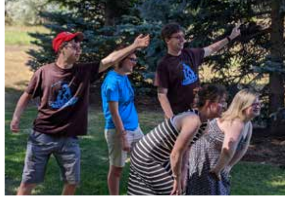
Tall Tales Ranch calls their growing family of young people with intellectual and developmental disabilities, such as autism and Down syndrome, their "ambassadors", and they are at the heart of their mission.